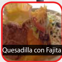
Quesadilla con Fajita

Slices of fajita, one enchilada, served with guacamole, pico de gallo and rice.